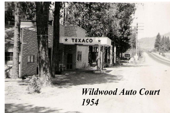
Wildwood Auto Court 1954