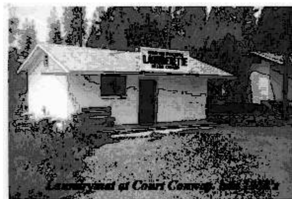
North Pacific Launderette