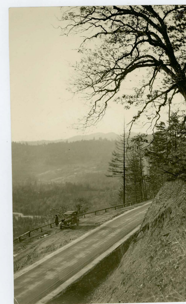
zone on Sexton Mtn., Pac. Hwy. S. in Josephine Co. Show combination type pavement. HP-2 #839 221

South Sexton Mt. Pacific Highway: 1921