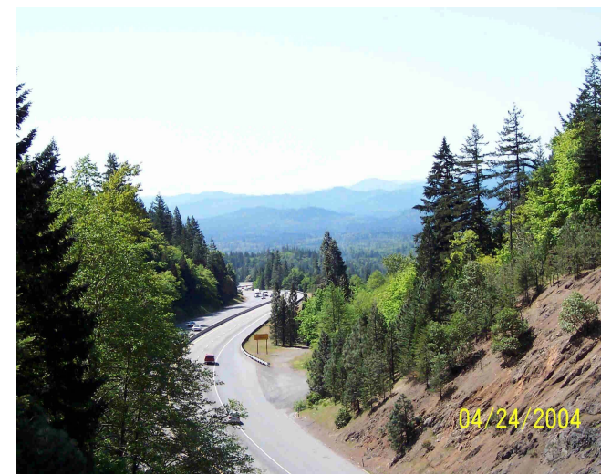
Northern I-5 Entrance to Hugo, Oregon