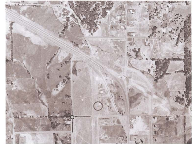
North Grants Pass I-5 Interchange: July 22, 1959

1966 The Oregon Highway Department's construction program hit one of its most significant milestones with the completion of I-5 to four lanes. It marked the first time travelers could enter the state at the Interstate bridge in Portland and head southbound along the high-speed freeway to California without one traffic signal or stop sign. The 308-mile highway was dedicated on October 22, 1966, in ceremonies at the Cow Creek Safety Rest Area in southern Douglas County. 2