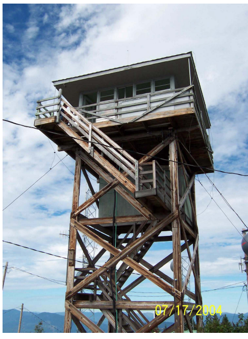
Sexton Mt. Lookout: 2004 Built in 1962

The drive from the Hugo I-5 interchange to the Sexton Mt. gate on BLM Road 34-6-23.1 is on pavement and gravel roads (two-wheel drive). The walk from the gate is .7 miles long and 500' in elevation.