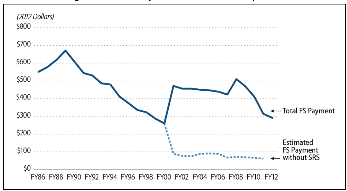
Figure 2. FS Total Payments and Estimated Payments

comparison of the FS actual payments to estimates of what the payments would have been had SRS not been enacted. FS receipts (for receipt-sharing purposes) in FY2011 totaled $323 million.<sup>5</sup> If receipt-sharing had been used rather than SRS payments then the 25% payments would have been less than $80 million. However, FY2011 payments under SRS actually totaled $308 million. Similarly, BLM timber receipts from western Oregon (which includes some non-O&C lands) totaled $22 million in FY2011.<sup>6</sup> If 50% payments had been used, then $11 million would have been transferred to the counties, compared to SRS payments of $40 million in FY2011. If SRS is not reauthorized, FY2013 payments will again be based on a percentage of agency receipts, estimated to be $85 million for the Forest Service portion of the payment.<sup>7</sup>