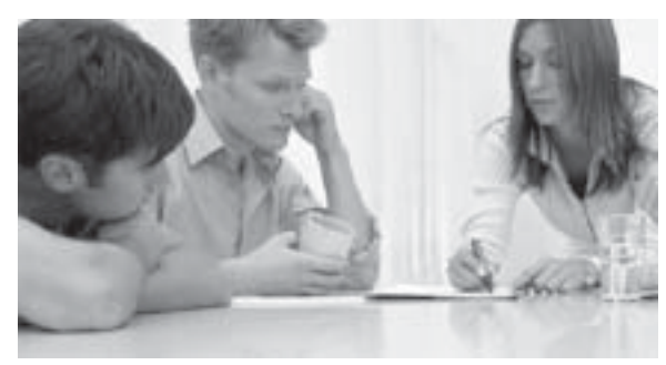
A plan for recruiting participants needs to identify who will be invited, how they will be contacted, and who will be responsible for inviting each group or individual.

Once you've identified who should participate in your effort, you need to remove barriers to their participation.