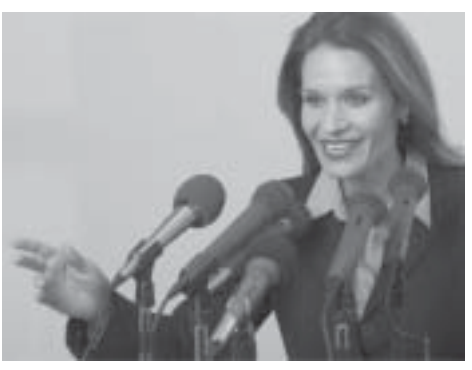
If your organization is small or volunteer-run, you should still have a point person for news media contact.

Contact person: Ideally, one person in your organization should be responsible for carrying out your MMP. Reporters are like everyone else: they're busy and they can't keep