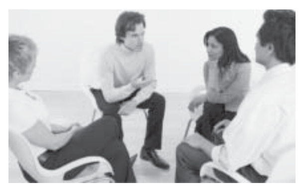
Focus groups are a powerful way to collect ideas, opinions, experiences, or beliefs about community issues.

one dominates the discussion; keeping the group focused on the subject at hand; and staying within established timeframes.