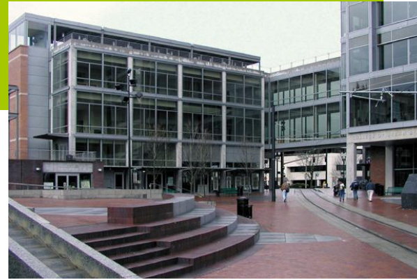
Hatfield School of Government, Portland State University