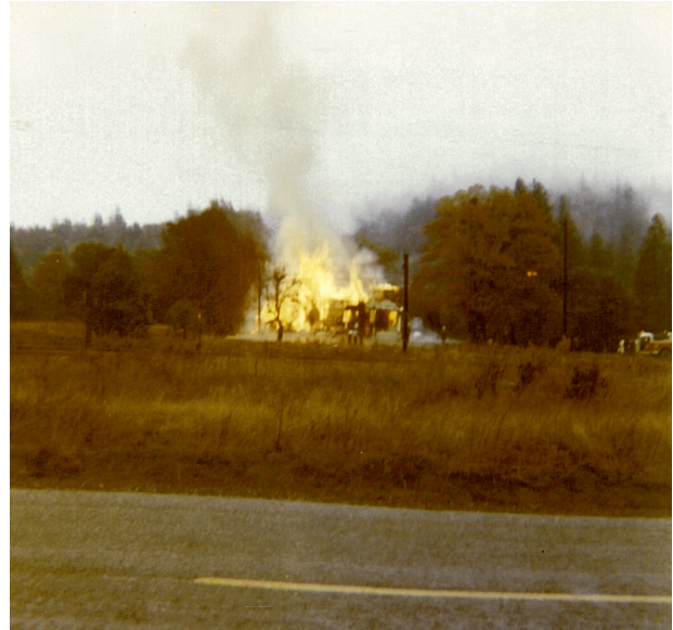
22 Hugo Hitching Post Burning: 1971

two 5-acre parcels were between Bummer Creek Lane and the Hugo Ladies Club. The property had never been developed until they bought it. They bought a new mobile home (see Photo 23), placed it on the lot, and started living "Hugo style." They immediately needed more room and Blake built a 24' by 50' garage (see Photo 24). They enjoyed looking up from their front